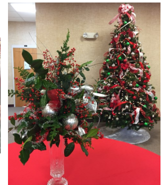
Various Activities During the Season