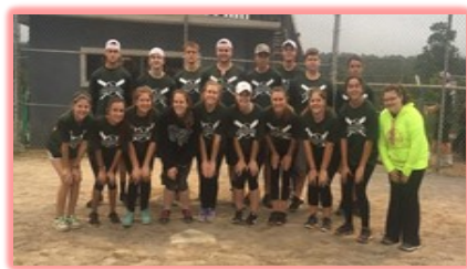
CONGRATULATIONS to our Youth Softball Team! They are the 2017 Dover Foundation YMCA Youth Church Softball CHAMPIONS