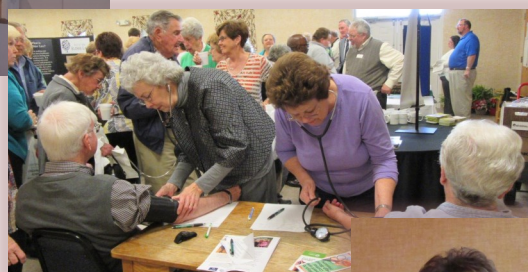
Assoc. Sr. Adult Rally