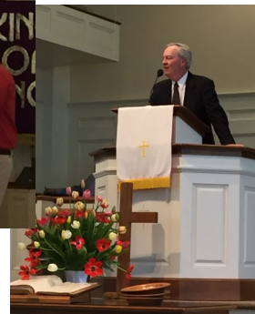
Baptist Men's Day