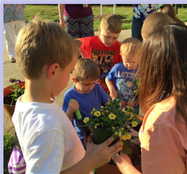
Children Planting Flowers