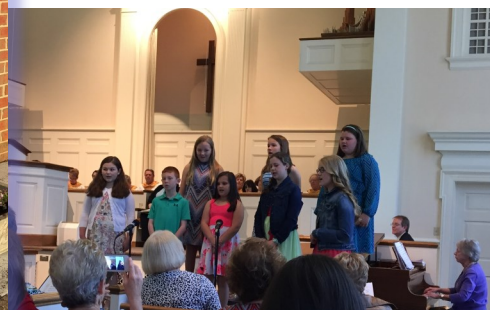
Young Musicians Singing