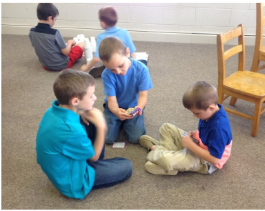
Children's Church CAUGHT ON CAMERA