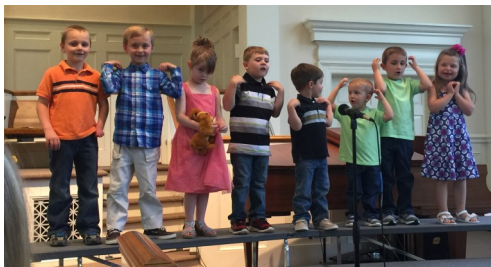
Children's Choirs performing their End-of-Year Music Programs