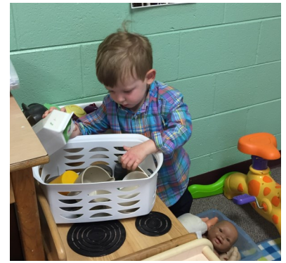
CAUGHT ON CAMERA